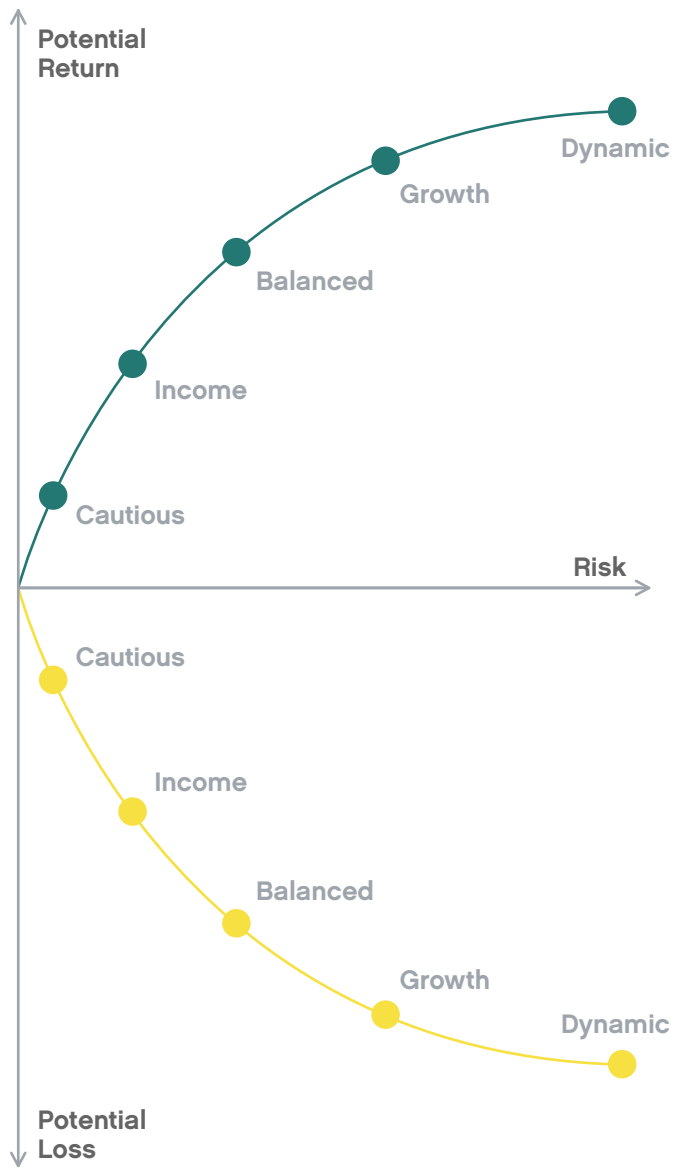
Our Investment Profiles

When you transfer the investment monies (or assets), you will be able to do so in complete confidence that your investments will be managed in line with everything that has been agreed.